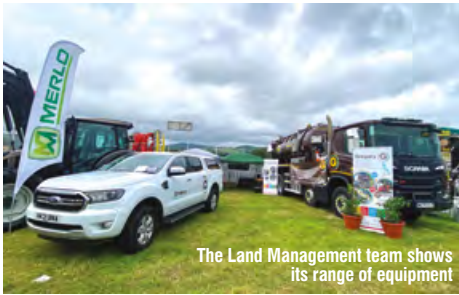
The Land Management team shows its range of equipment