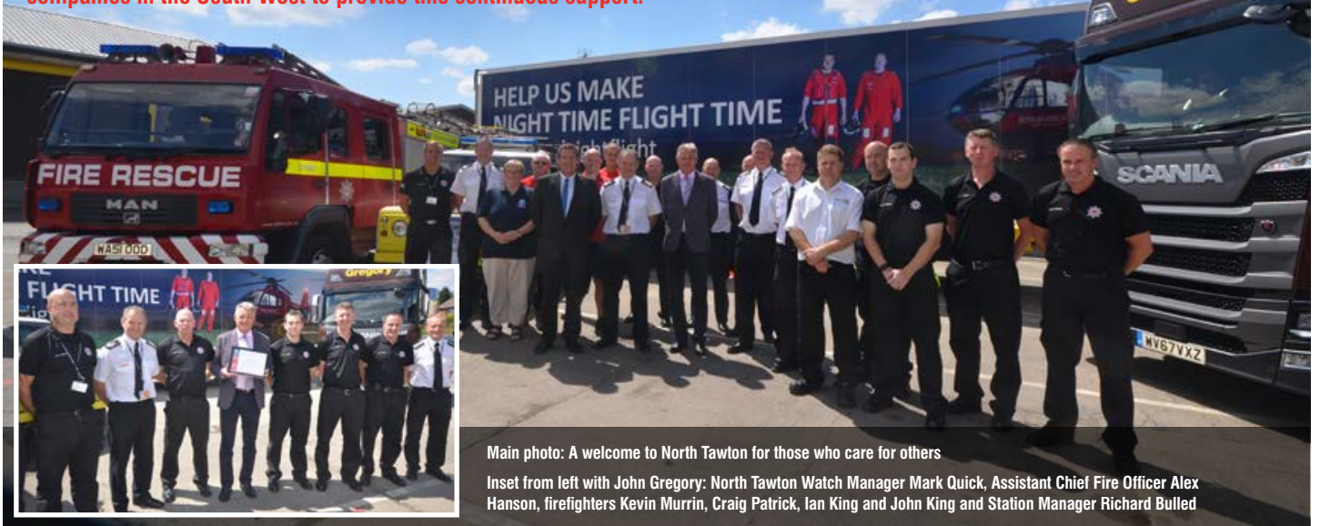
Main photo: A welcome to North Tawton for those who care for others